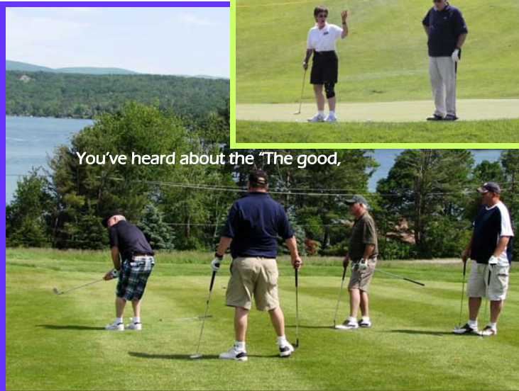
You've heard about the "The good,"