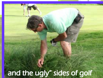
and the ugly' sides of golf